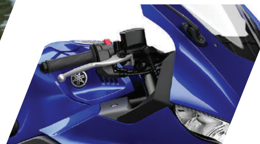
LOW FUEL TANK AND HANDLEBAR POSITION