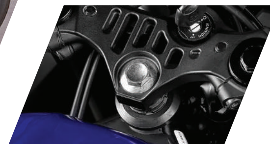
YZR-M1 INSPIRED CAST ALUMINIUM HANDLEBAR CROWN