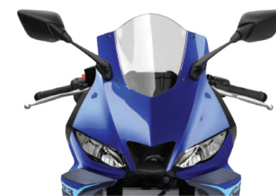
AGGRESSIVE R1-INSPIRED FACE