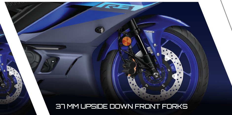
37 MM UPSIDE DOWN FRONT FORKS