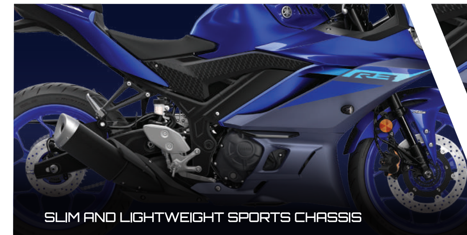
SLIM AND LIGHTWEIGHT SPORTS CHASSIS