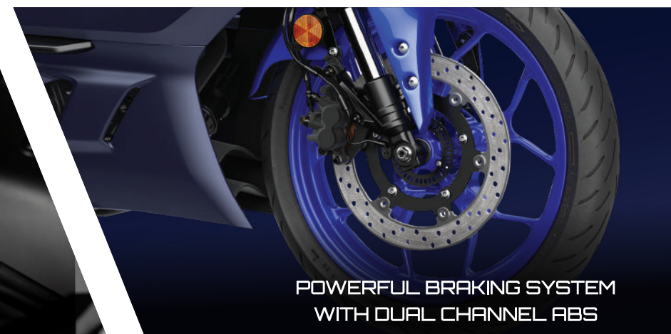
POWERFUL BRAKING SYSTEM WITH DUAL CHANNEL ABS