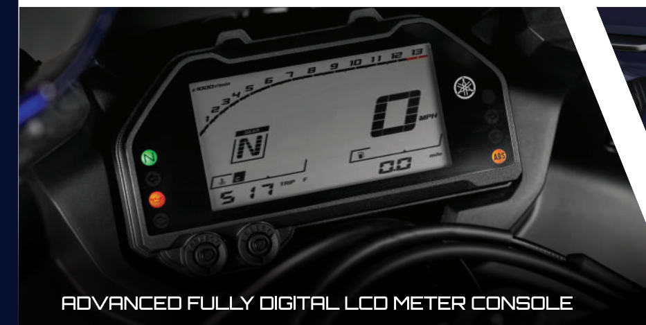
ADVANCED FULLY DIGITAL LCD METER CONSOLE