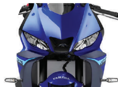
LED FLASHERS – FRONT & REAR