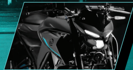
Aggressive & dynamic body design