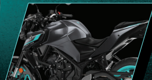
Ergonomic riding position