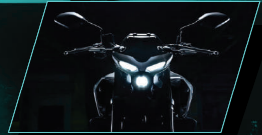
LED headlight with dual eye positions lights