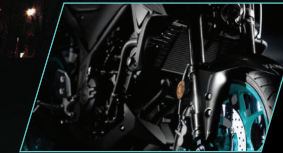
37mm upside down front forks