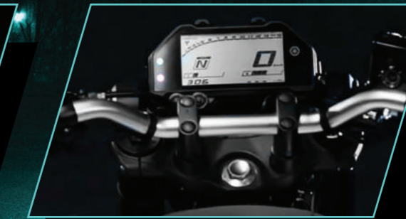
Advanced LCD meter console