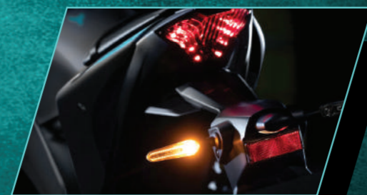
LED flashers - front & rear