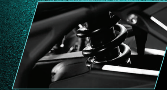
Long swingarm with optimal shock settings