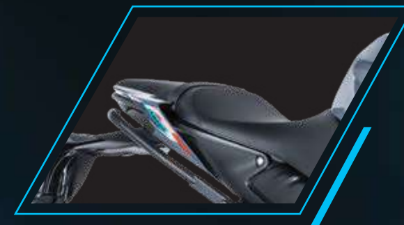
UNI-LEVEL SEAT WITH GRAB BAR