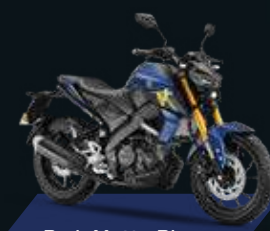
Dark Matte Blue