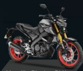
Metallic Black - DLX