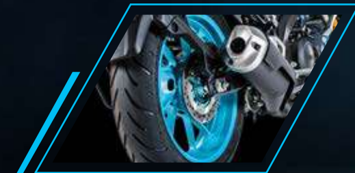
SUPER WIDE 140mm RADIAL REAR TYRE