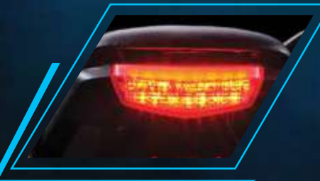
RAISED LED TAIL LIGHT