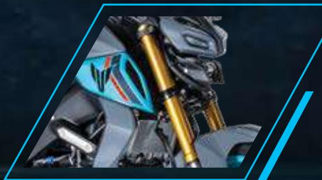
UPSIDE DOWN FRONT FORKS

*Not equipped in Metallic Black & Dark Matte Blue