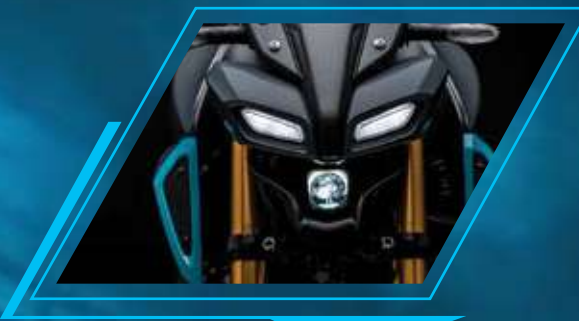
BI-FUNCTIONAL CLASS (D) LED HEADLIGHT