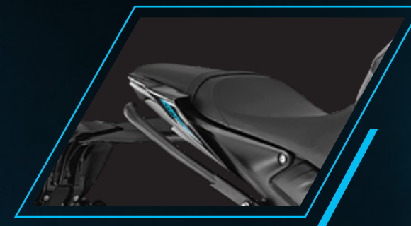
UNI-LEVEL SEAT WITH GRAB BAR