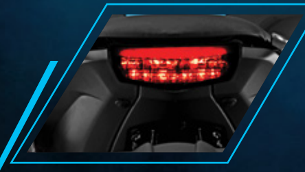
RAISED LED TAIL LIGHT