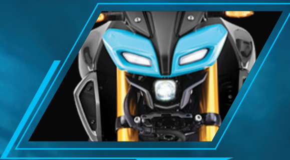
BI-FUNCTIONAL CLASS (D) LED HEADLIGHT