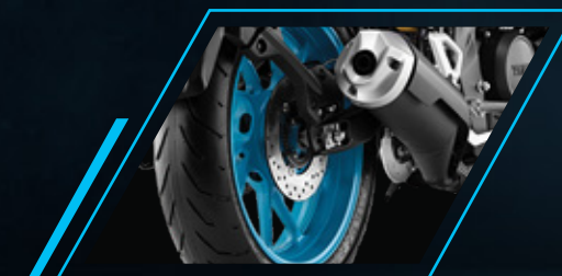
SUPER WIDE 140mm RADIAL REAR TYRE