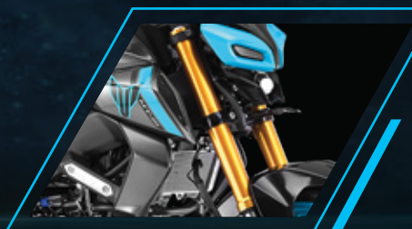
UPSIDE DOWN FRONT FORKS

*Not equipped in Metallic Black & Dark Matte Blue