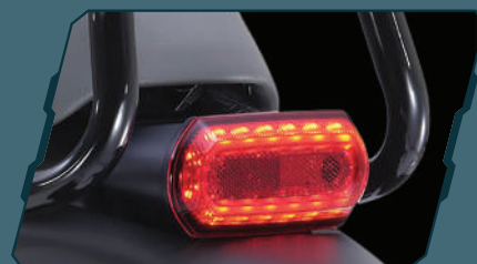
SLEEK LED TAIL LIGHT