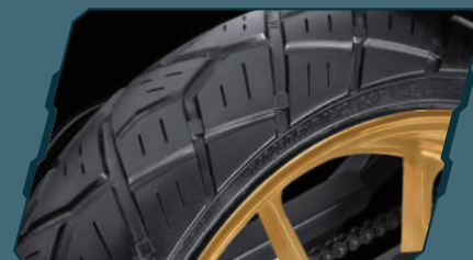
BLOCK PATTERN TYRES