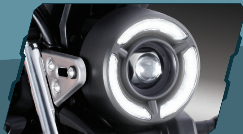
BI-FUNCTIONAL LED HEADLIGHT WITH DRL