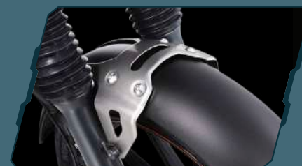
TELESCOPIC SUSPENSION WITH FRONT FORK BOOTS