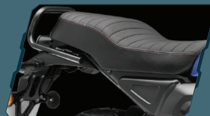
TWO-LEVEL SEAT WITH TUCK AND ROLL