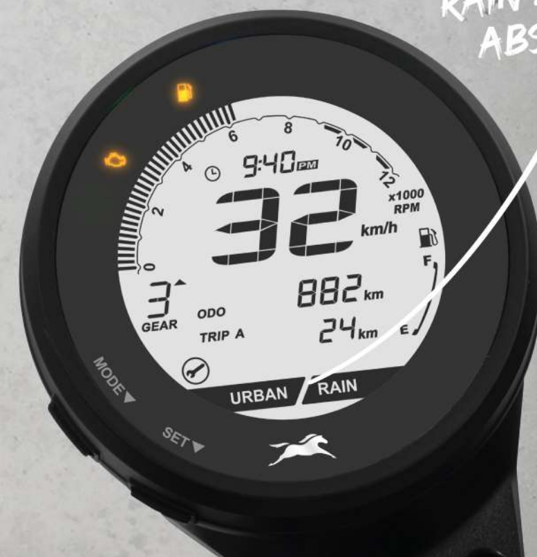
RAIN & URBAN ABS MODE