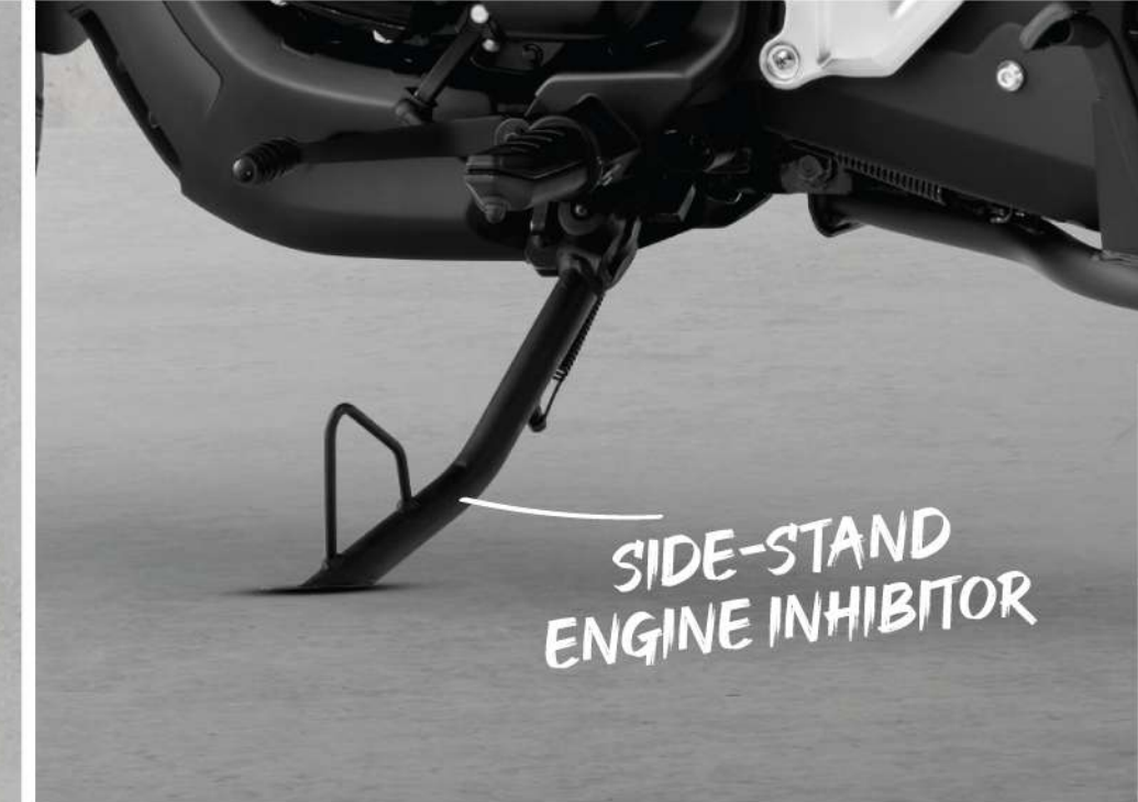
SIDE-STAND ENGINE INHIBITOR

Engineered to keep you safe, the TVS RONIN's switchable rain & urban ABS modes allow you to ride and brake confidently in the rain, and in the unpredictable urban jungle! Safety also comes in the form of a side-stand engine inhibitor which makes sure you ride, only once the side-stand is safely tucked away. While the large front & rear disc brakes with dual channel ABS make sure you come to a safe and stable stop, every time.