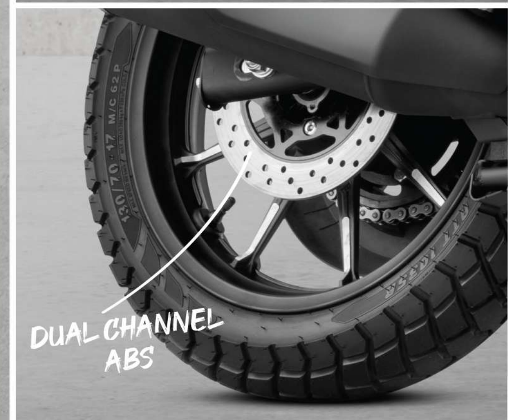
DUAL CHANNEL ABS