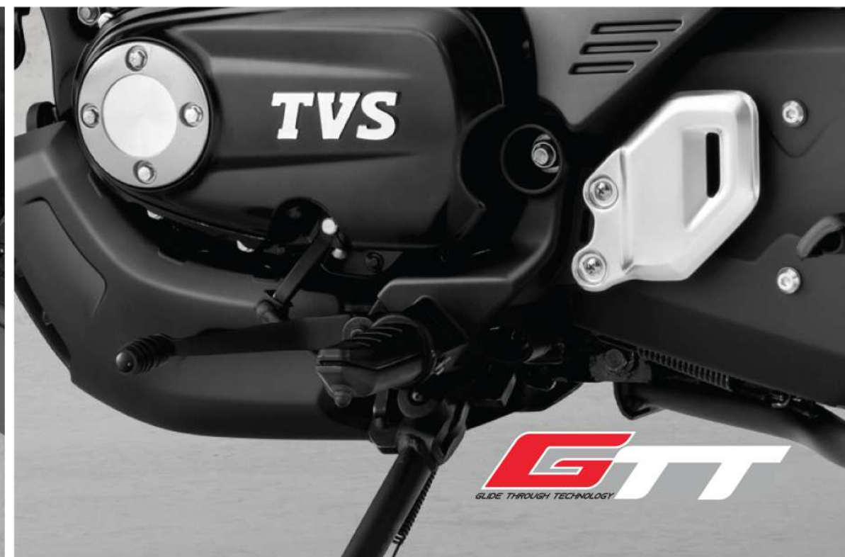
GTT GLIDE THROUGH TECHNOLOGY