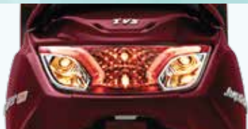
STYLISH TAIL LAMP