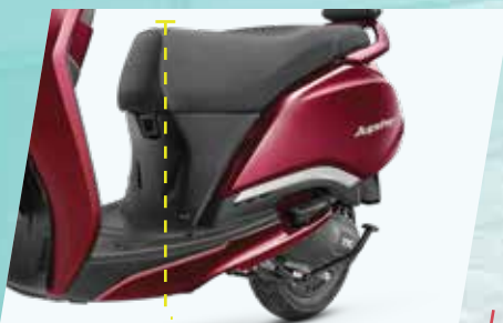
EASY GROUND REACH