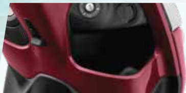
SPACIOUS 2L GLOVE BOX