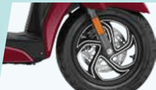
DIAMOND-CUT ALLOY WHEELS