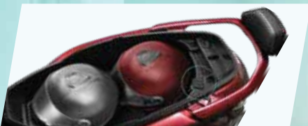
LARGEST 33L UNDERSEAT STORAGE