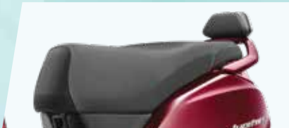
LONGEST FLAT SEAT