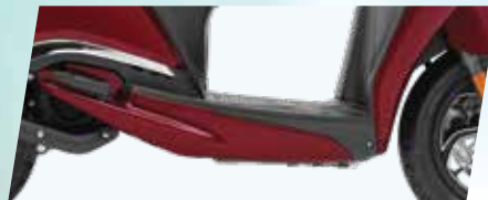
LARGE FRONT LEG SPACE