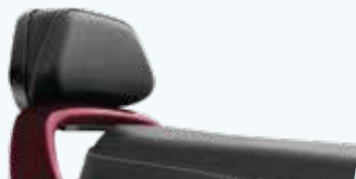
COMFORTABLE BACKREST FOR PILLION RIDER