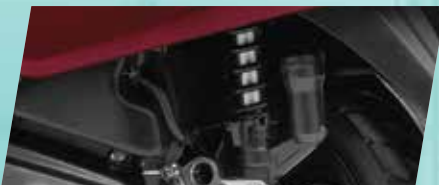
ADJUSTABLE REAR SHOCKS FOR EXTRA CUSHIONING