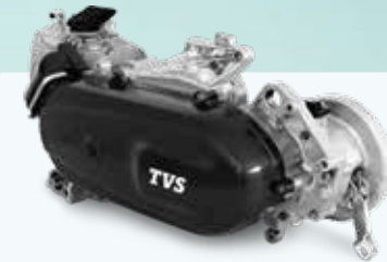
ALL-NEW REFINED ENGINE

TVS iGo Assist is an advanced technology designed to enhance both performance and fuel efficiency. This addition further reinforces TVS Jupiter 125's position as a technologically-superior, fuel-efficient scooter.