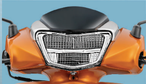
STYLISH LED HEADLAMP WITH VISOR