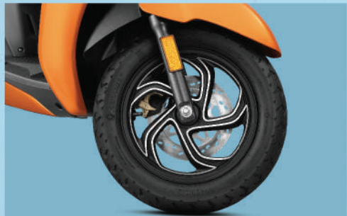
DIAMOND-CUT ALLOY WHEELS