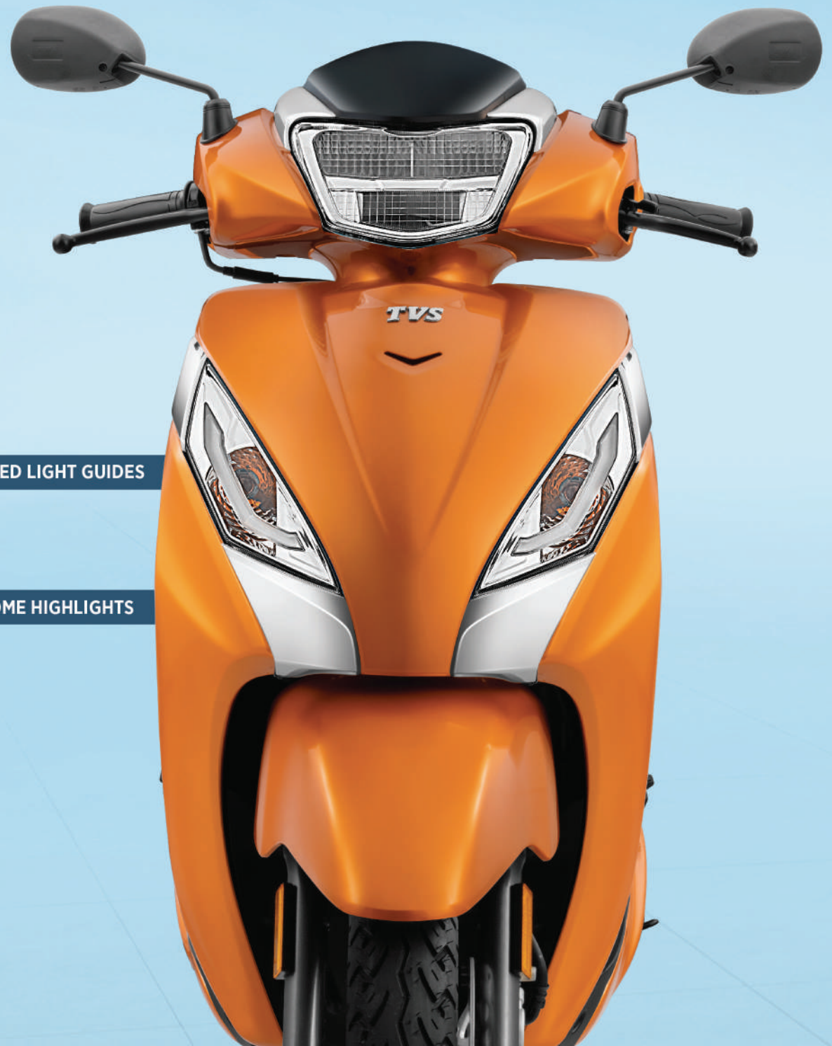
SIGNATURE LED LIGHT GUIDES