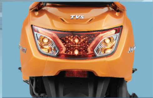
ELEGANT TAIL LAMP