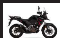
YVB (Glass Sparkle Black)