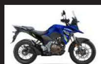
QY1 (Pearl Fresh Blue) + YVB (Glass Sparkle Black)