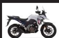
YWW (Pearl Glacier White) + YUA (Met. Mat Stellar Blue)