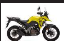
YU1 (Champion Yellow No.2) + YVB (Glass Sparkle Black)