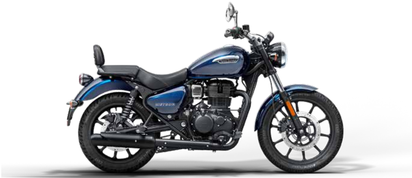
Stellar Marine Blue