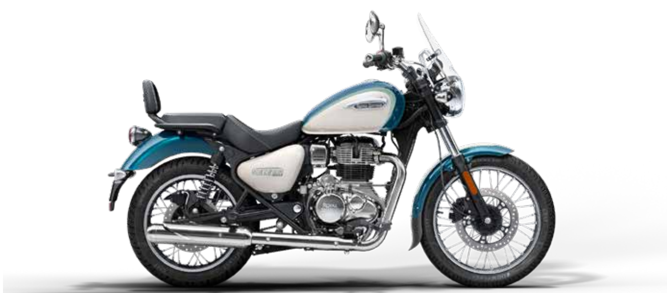
Aurora Retro Green