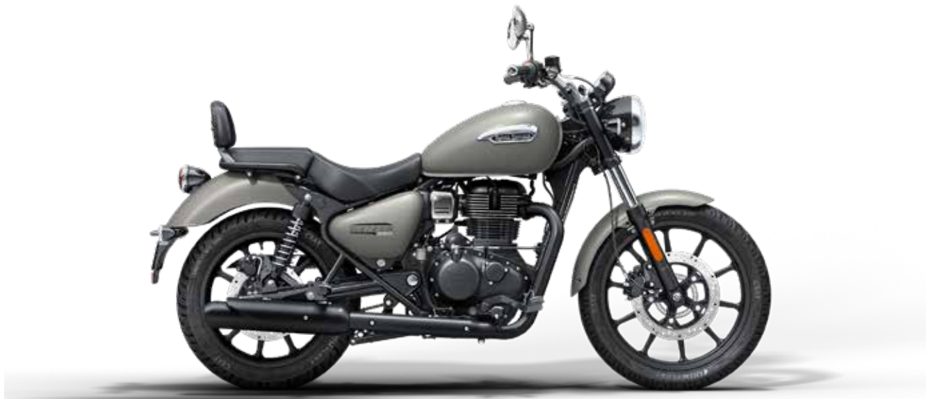
Stellar Matt Grey