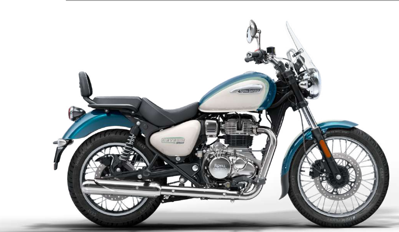
Aurora Retro Green