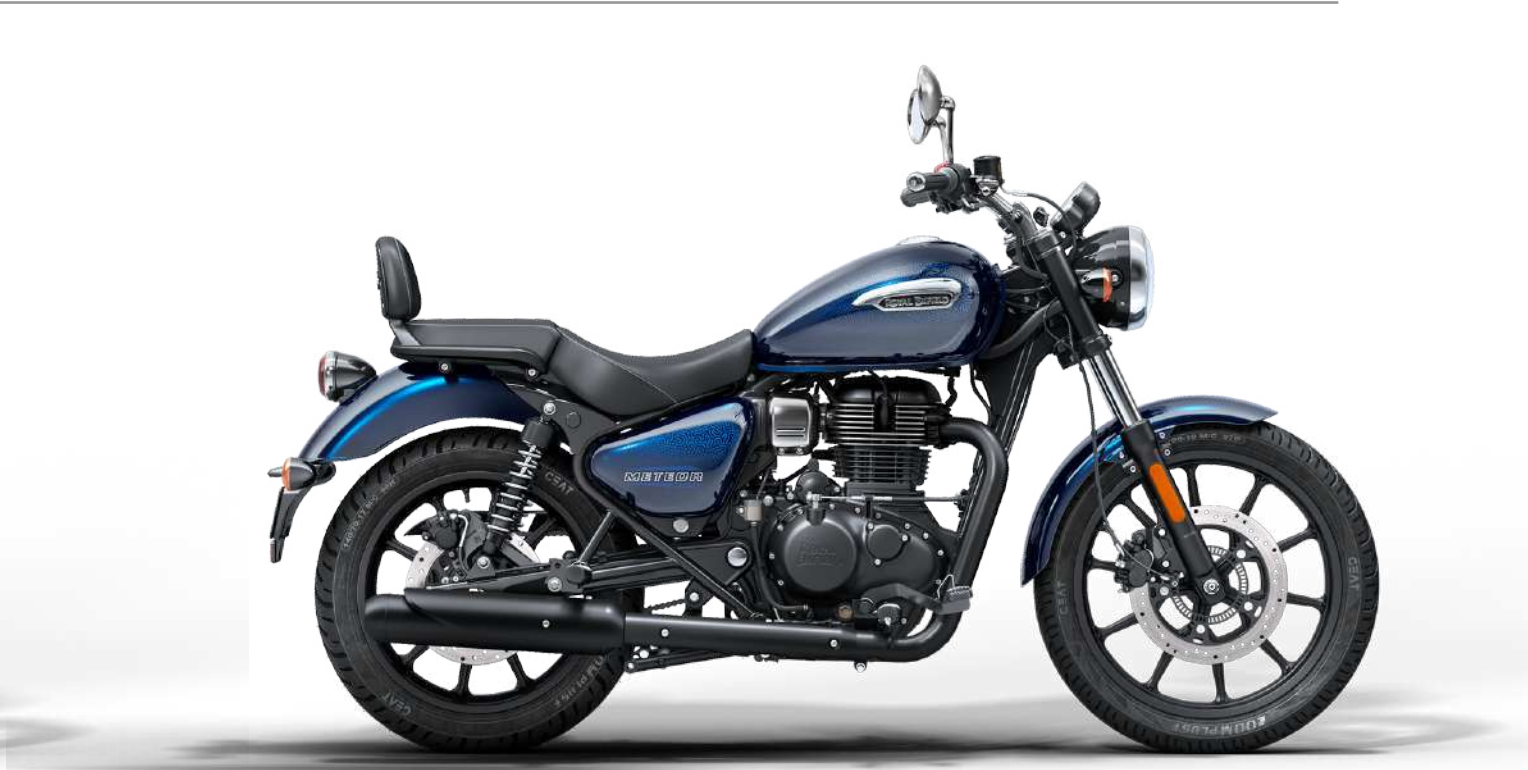
Stellar Marine Blue