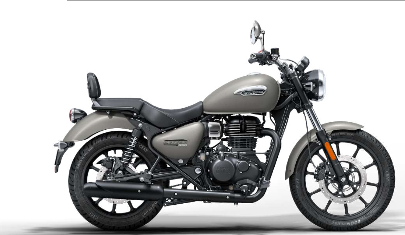
Stellar Matt Grey