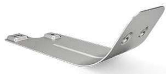
LARGE ENGINE GUARD, SILVER 1990407