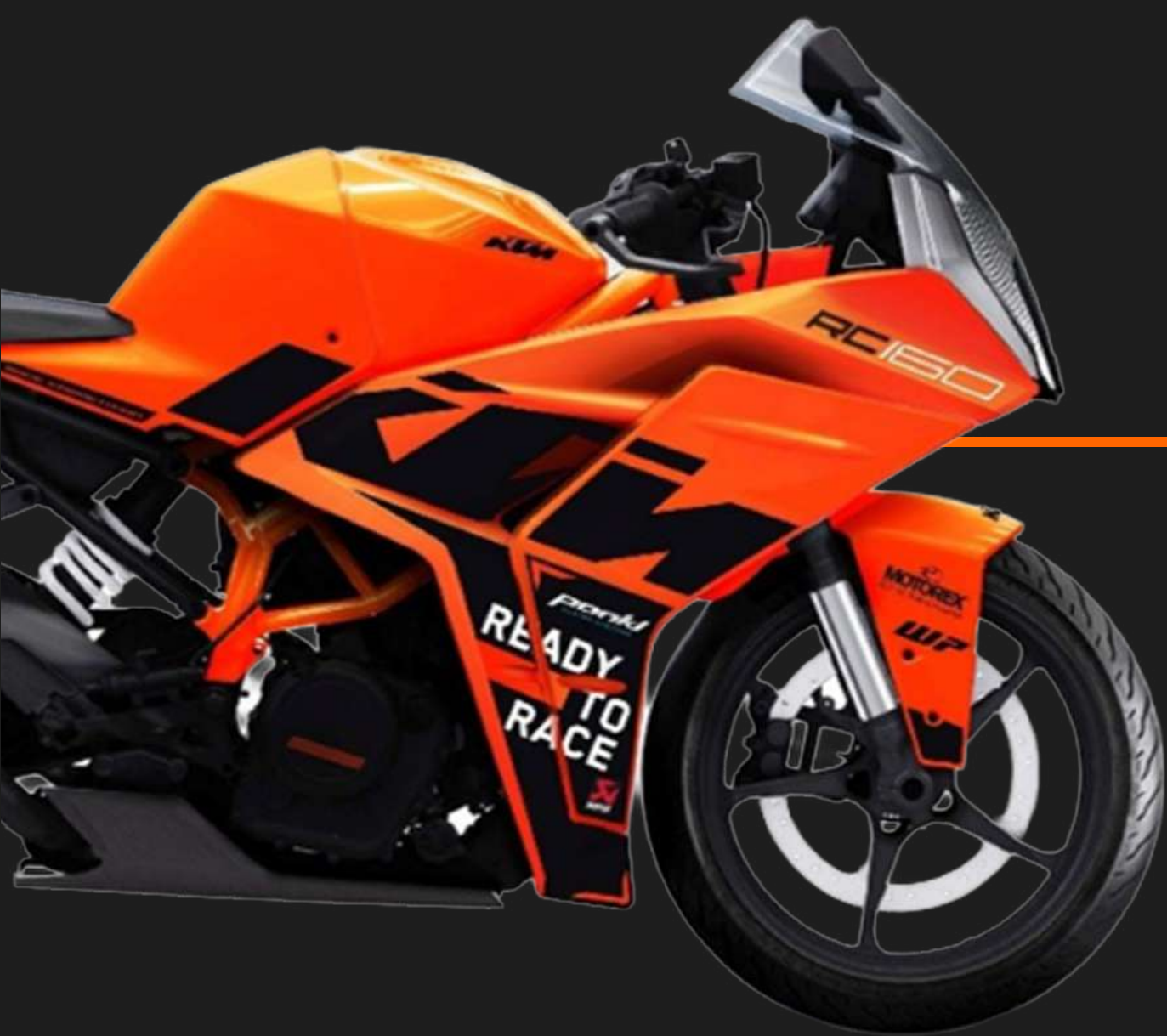
ELECTRONIC ORANGE MATT