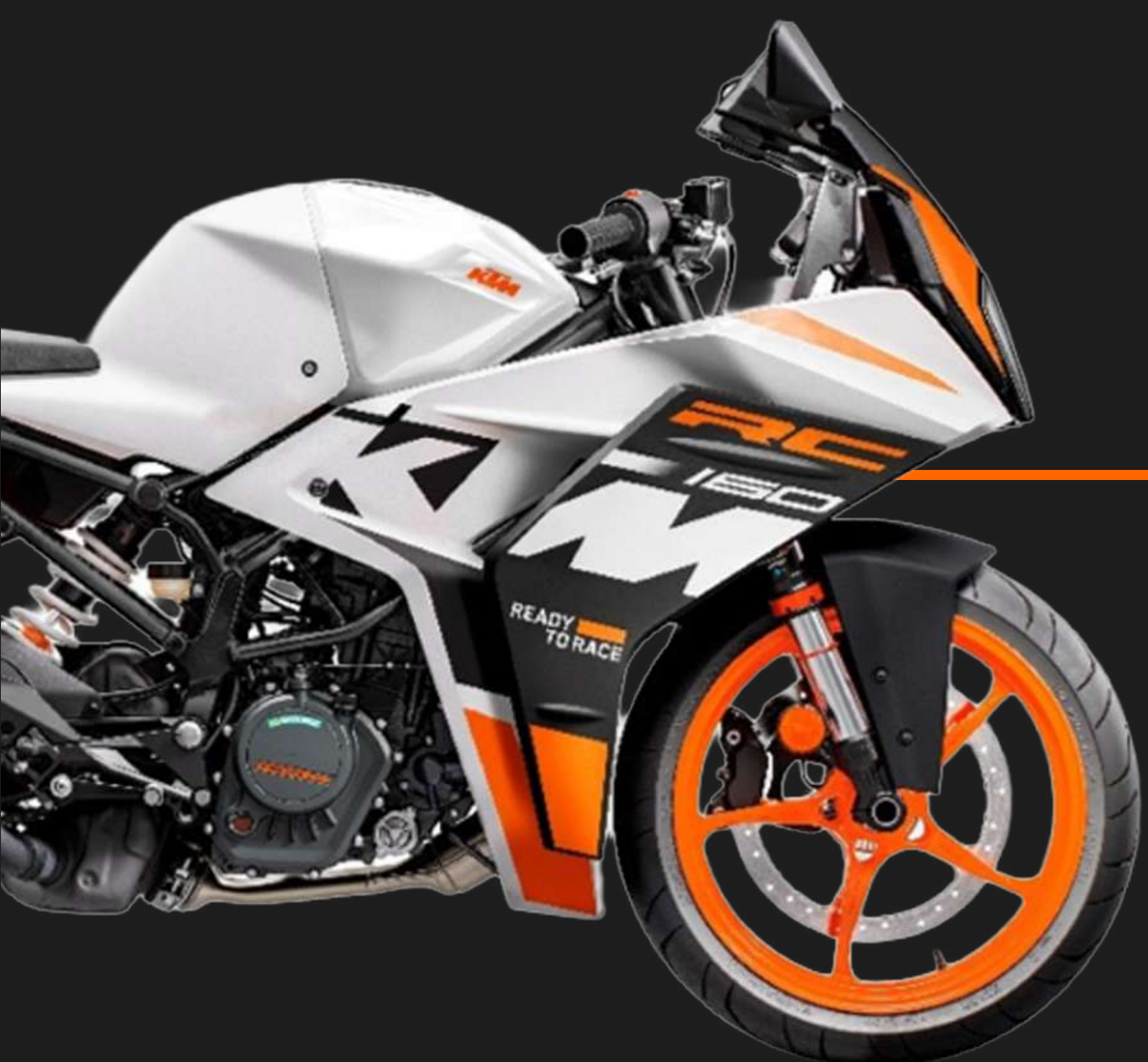
CERAMIC WHITE MATT