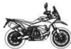
KTM 890 ADVENTURE R