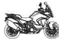
KTM 1290 SUPER ADVENTURE S