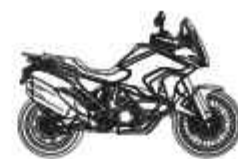
KTM 1290 SUPER ADVENTURE R