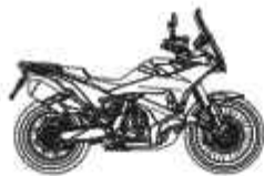
KTM 790 ADVENTURE