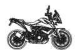
KTM 390 ADVENTURE