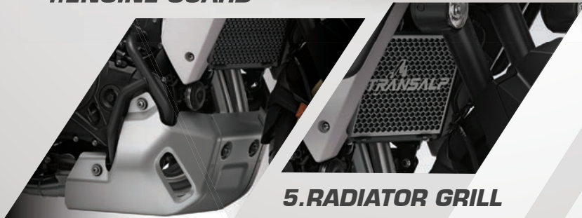
5. RADIATOR GRILL