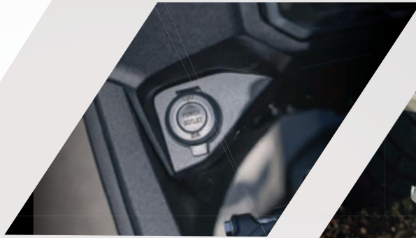
6. SOCKET KIT