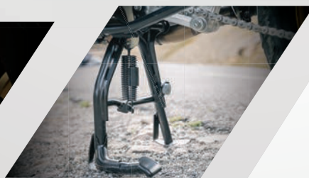
9. CENTRE STAND