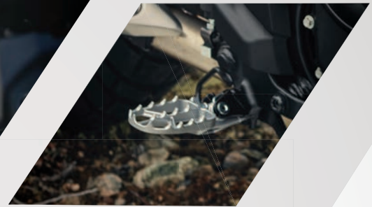
7. RALLT STEP