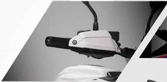
1. KNUCKLE GUARD