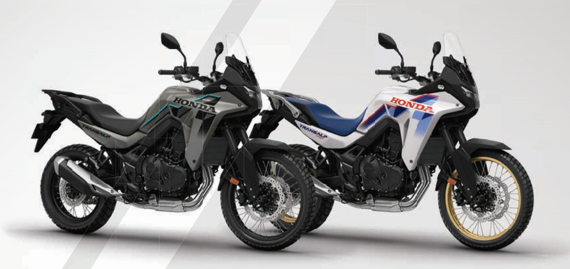
PEARL DEEP MUD GREY