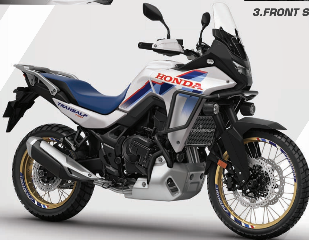
4. ENGINE GUARD