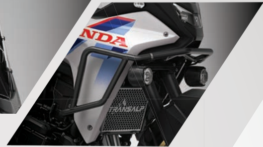
3. FRONT SIDE PIPE