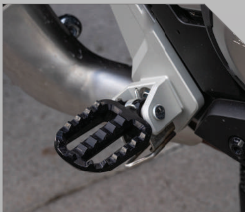
RIDER FOOT PEG