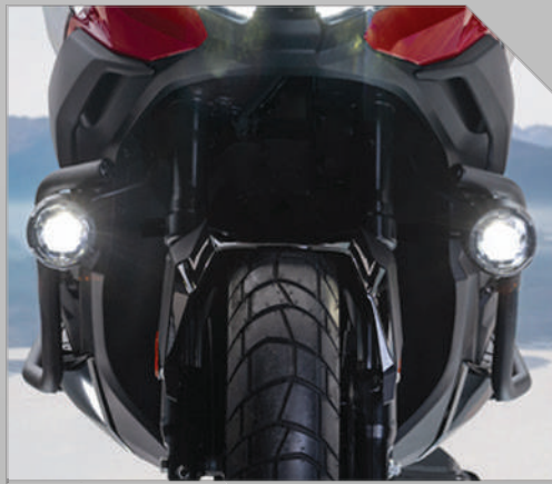
FRONT FOG LIGHT