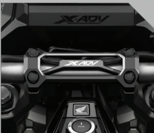
HANDLE HOLDER UP