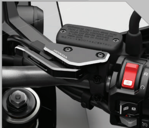
PARKING LEVER AND COVER