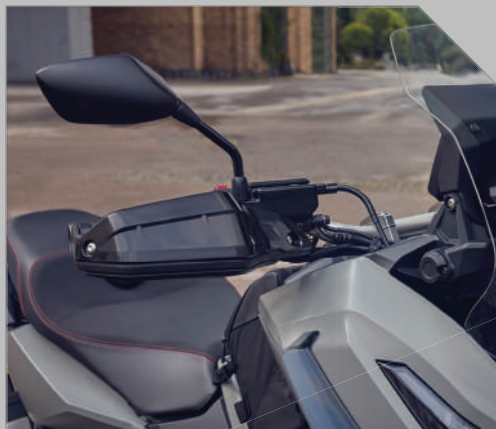
KNUCKLE GUARD EXTENSION