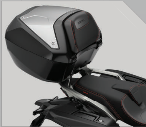
TOP BOX - MANUAL