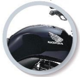
Pearl Siren Blue