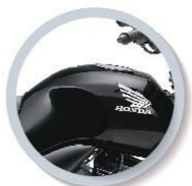
Pearl Igneous Black