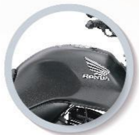
Matt. Axis Grey Metallic