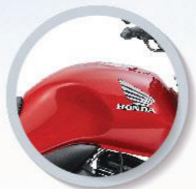
Imperial Red Metallic