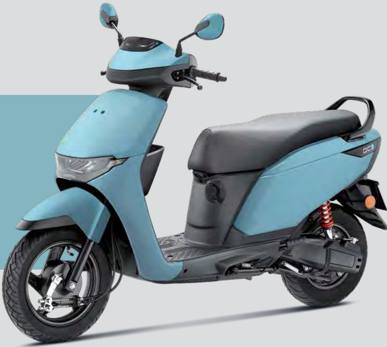
Pearl Shallow Blue