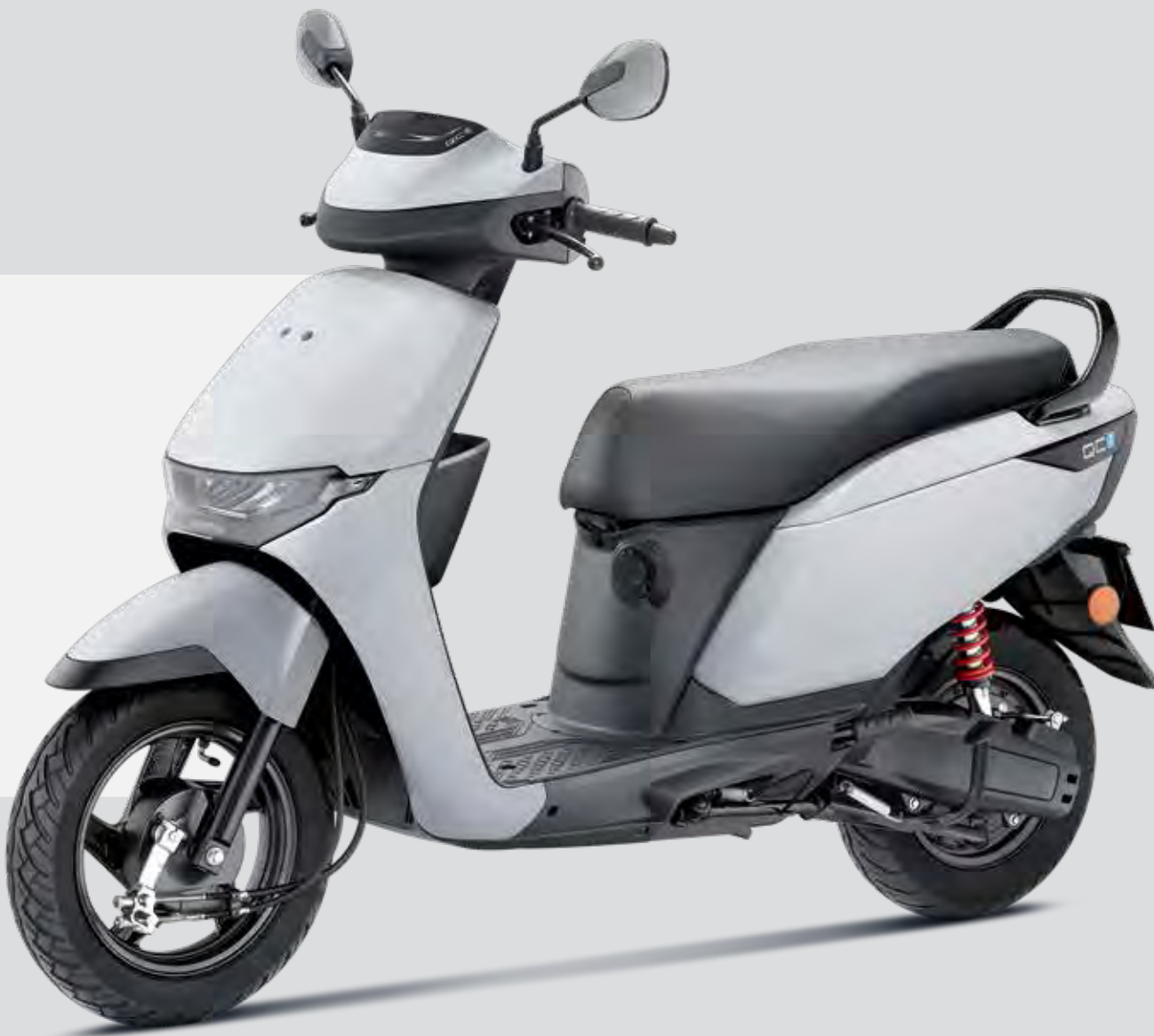
Pearl Misty White