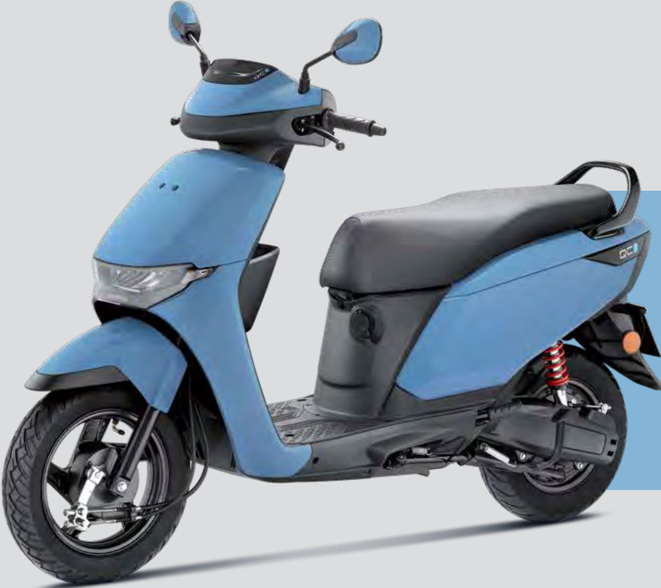
Pearl Serenity Blue

Choose from a range of stunning colours that reflect your personality.