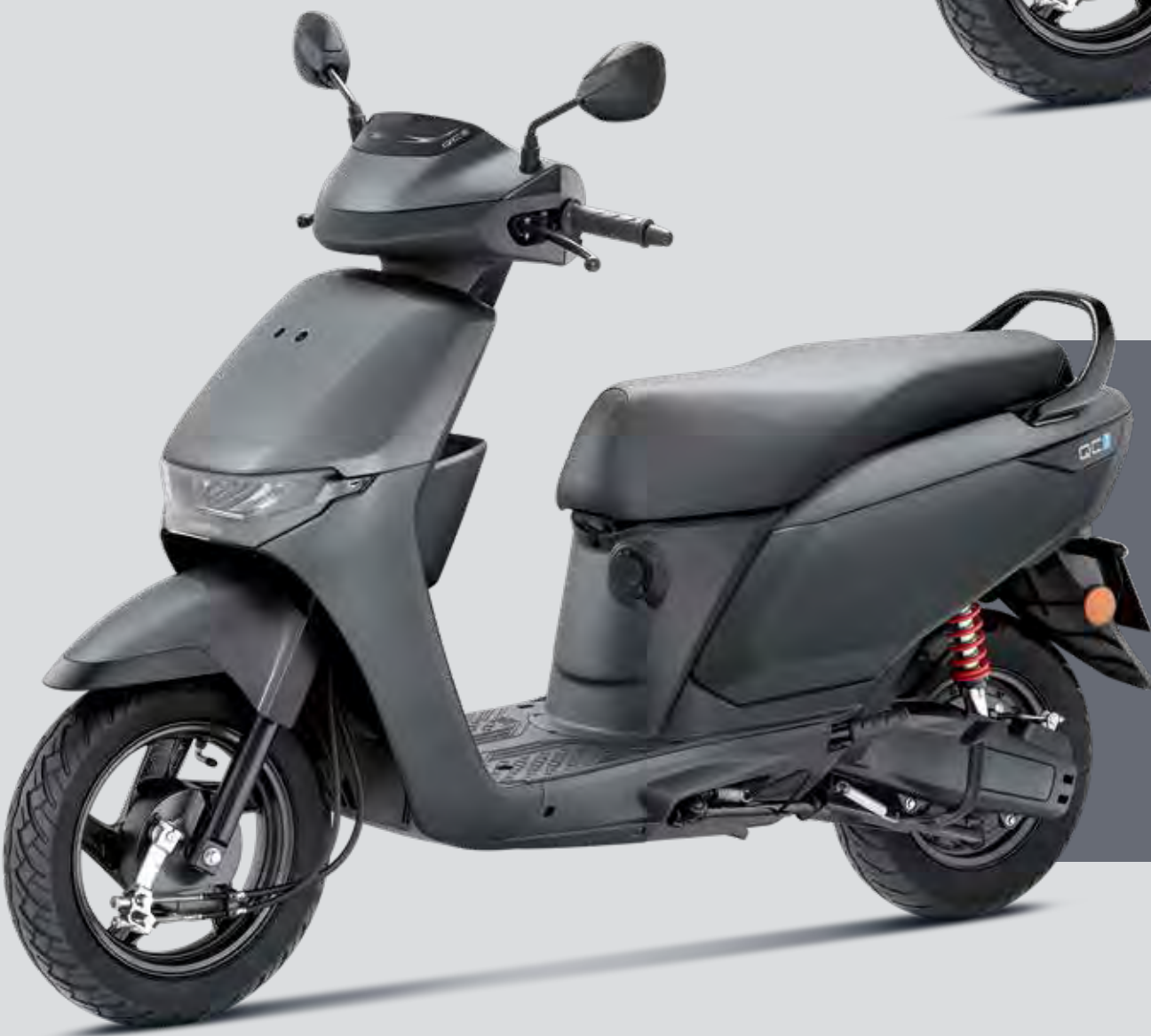
Matt Foggy Silver Metallic