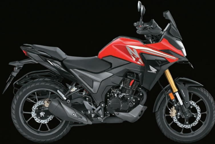
Radiant Red Metallic