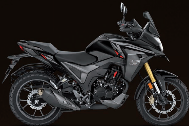
Pearl Igneous Black