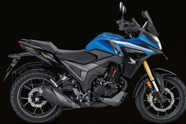
Athletic Blue Metallic