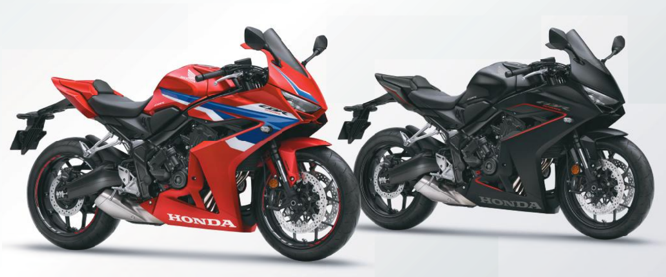
GRAND PRIX RED