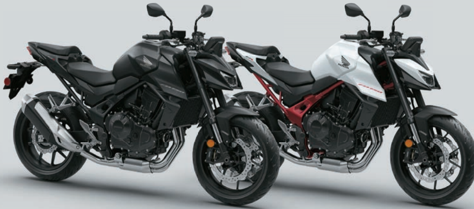
MATTE BALLISTIC BLACK METALLIC