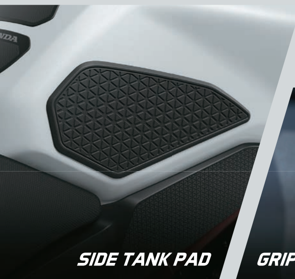
SIDE TANK PAD