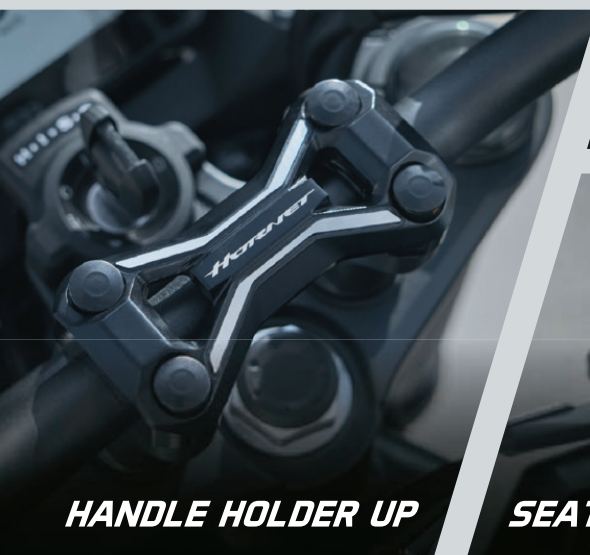
HANDLE HOLDER UP