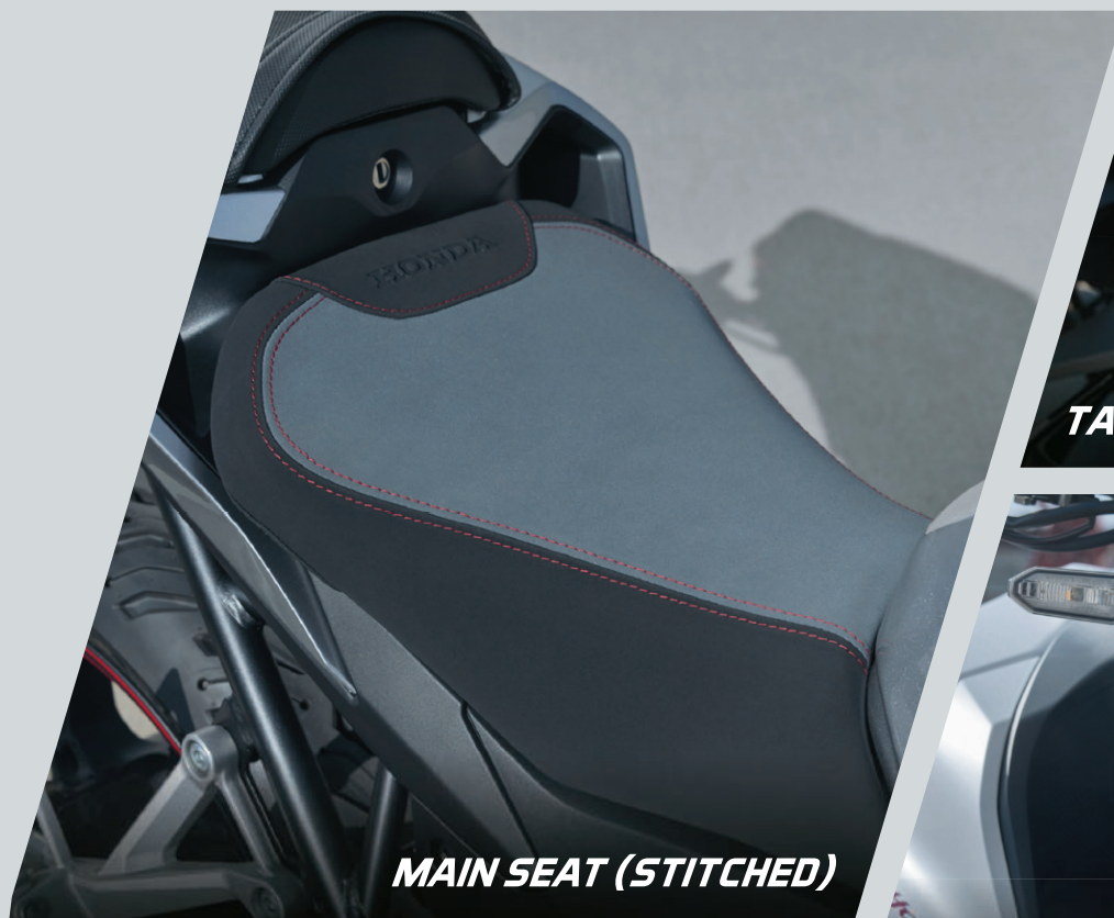
MAIN SEAT (STITCHED)