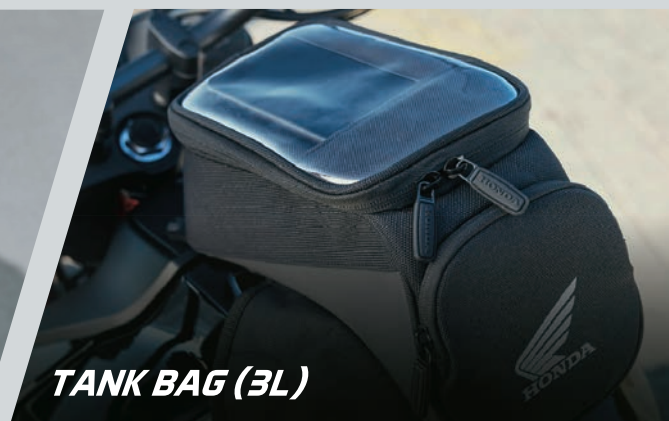
TANK BAG (3L)