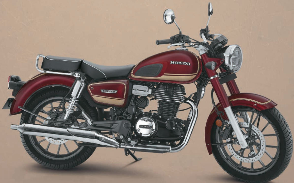
Rebel Red Mettalic