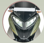
DUAL CHAMBER LED HEADLAMP