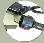
3s SILENT START TECHNOLOGY