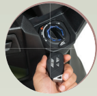
SMART KEY WITH REMOTE SEAT OPENING