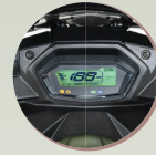
DIGITAL SPEEDOMETER WITH TURN-BY-TURN