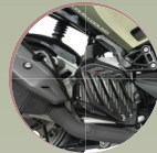
LIQUID COOLED ENGINE WITH 4 VALVE SINGLE CYLINDER SOHC