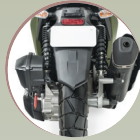
REAR DUAL SHOCK ABSORBERS