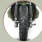
BLOCK PATTERN TYRES