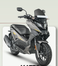
MATTE VOLCANIC GREY

*Based on the testing report of Govt. certified agency. Actual mileage may vary as per riding conditions.