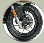
14 INCH LARGE WHEELS