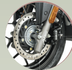
FRONT DISC BRAKE WITH ABS