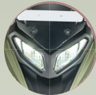
LED POSITION LAMP