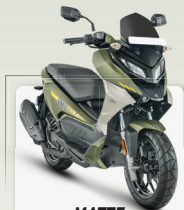
MATTE RAINFOREST GREEN