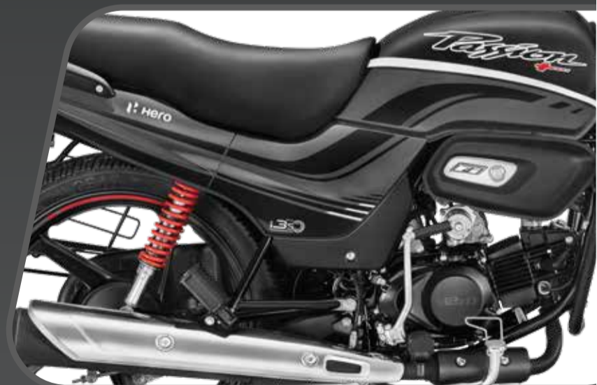
DARK INDUSTRIAL GREY