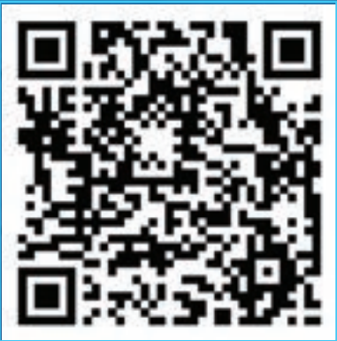
Scan the QR Code To Know More