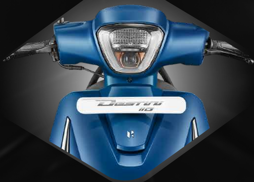
NEO RETRO DESIGN