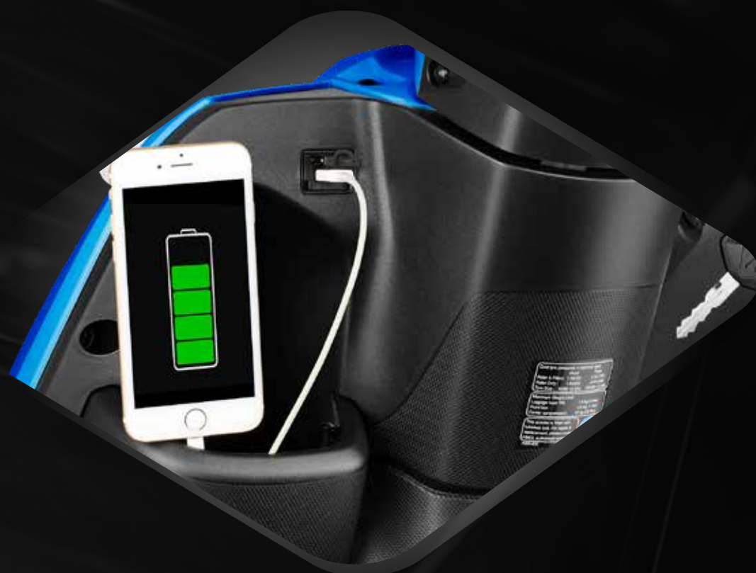
MOBILE CHARGING GLOVE BOX