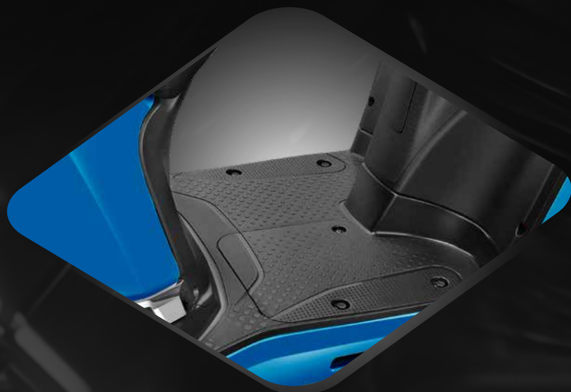
BEST IN SEGMENT 154mm LEGROOM