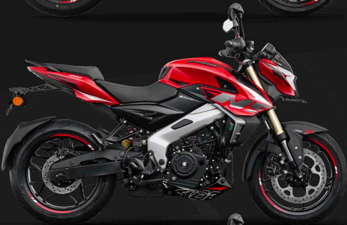
GLOSSY RACING RED