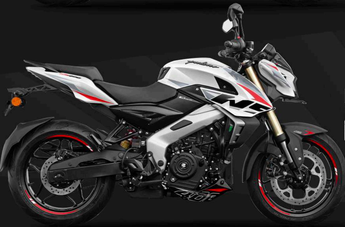
PEARL METALLIC WHITE