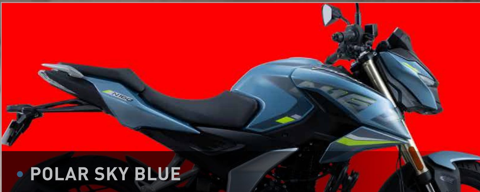
• POLAR SKY BLUE