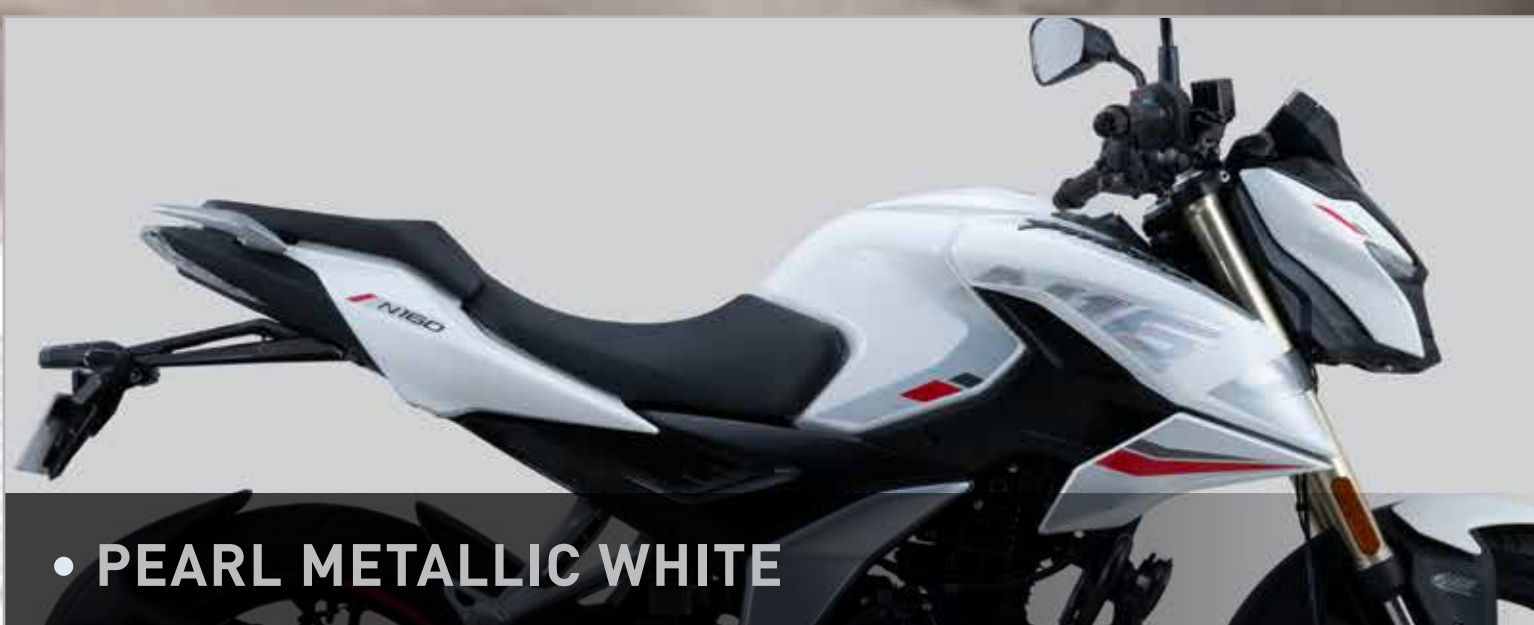
• PEARL METALLIC WHITE