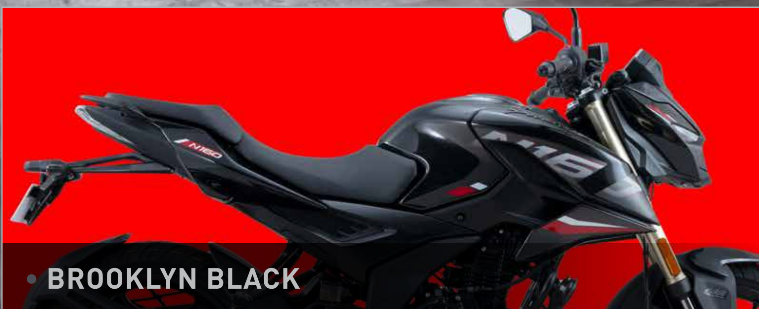
• BROOKLYN BLACK