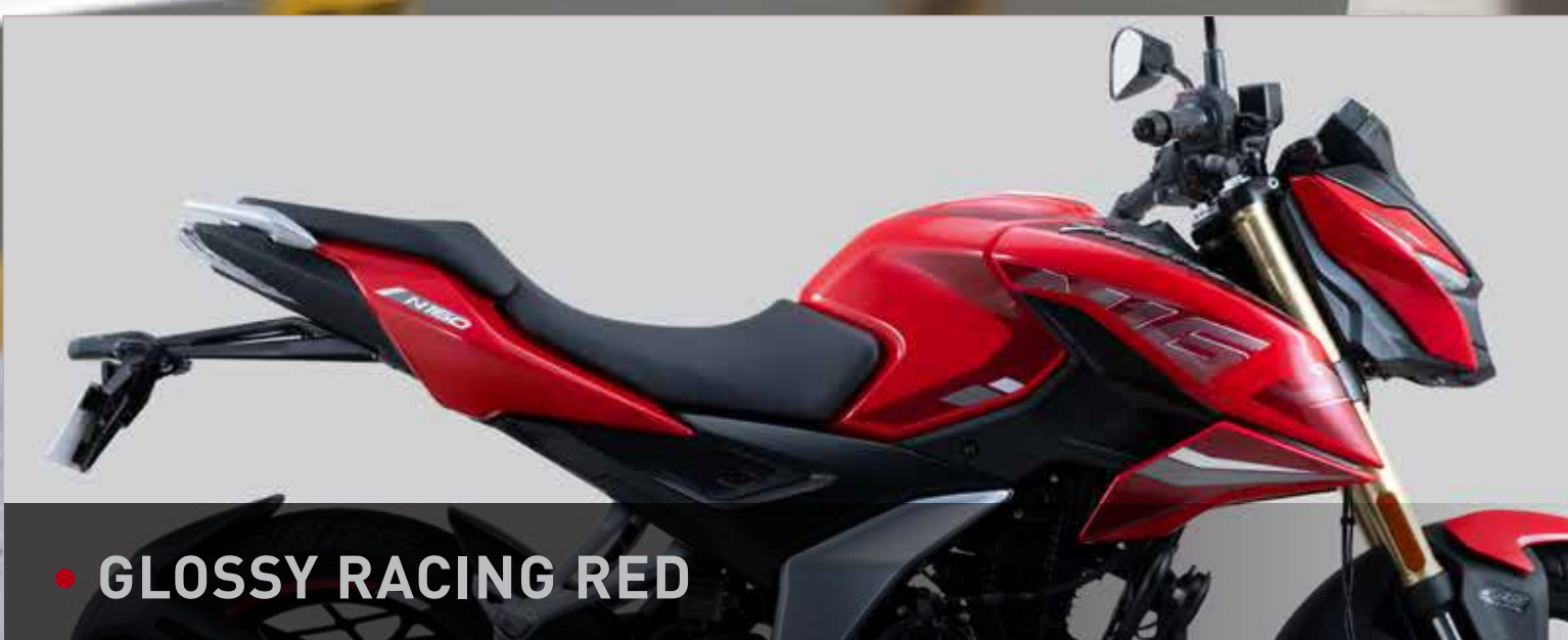
• GLOSSY RACING RED