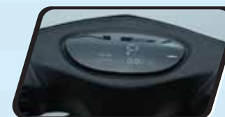
Colored LCD Cluster