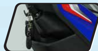
Keyless Start with Premium KeyFob