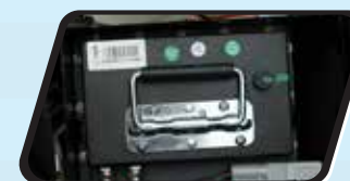
Safe LFP Battery