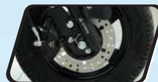
Front Disc Brake