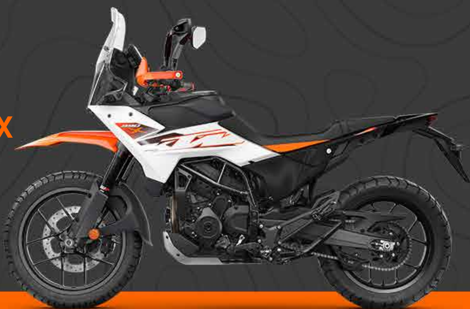
KTM 390 ADVENTURE X Ceramic White