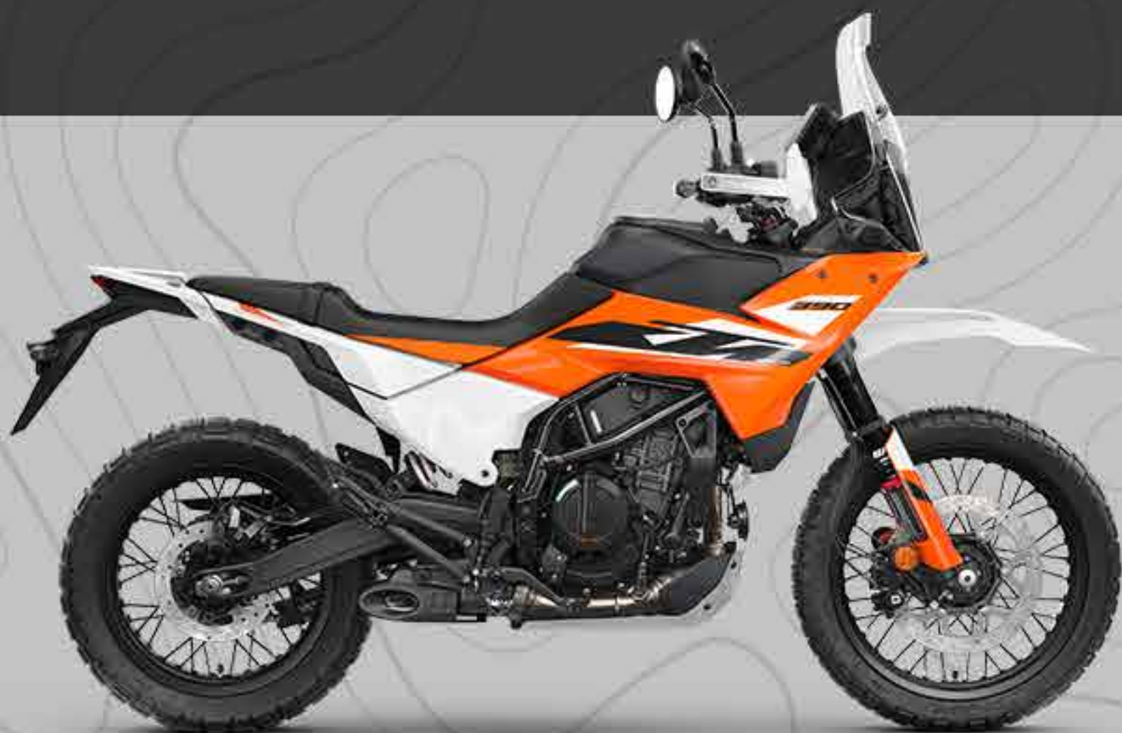
KTM 390 ADVENTURE Electronic Orange