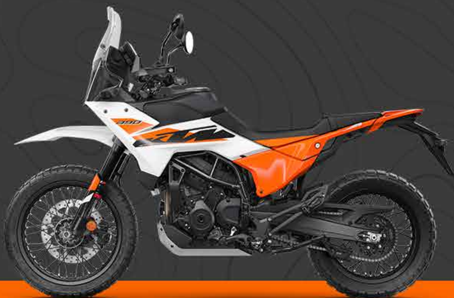
KTM 390 ADVENTURE Ceramic White