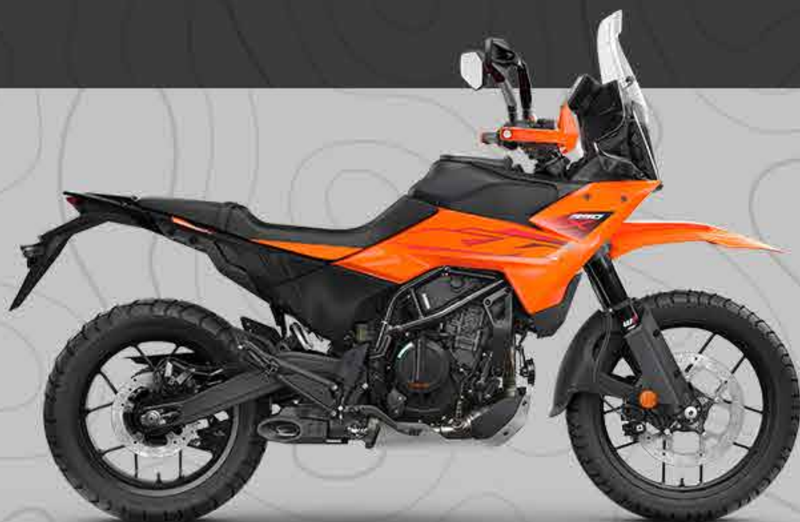
KTM 390 ADVENTURE X Electronic Orange