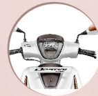
PROJECTOR LED WITH DRL